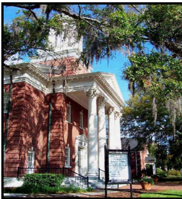
Knowles Memorial Chapel Rollins College Winter Park 1885